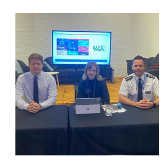
Canterbury Retail Round Table