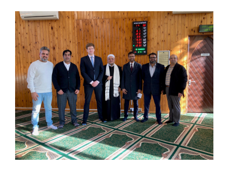
Al-Birr Community Centre and Mosque in Margate